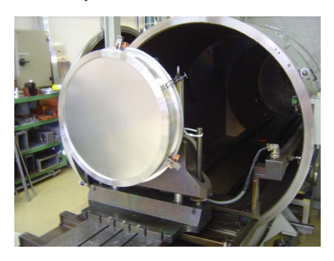
Figure 2: Window prototype in EB chamber

Replacing the stainless foil with titanium would be a potential upgrade option. It would result in a reduction of a factor of 3.2 in the foil stress (see Table 1), which would allow the foil to resist the 'single kicker failure' case without plastic deformation.